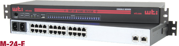
DSM-24-E 24 RJ45 RS232 Ports, Dual Power, Dual Ethernet