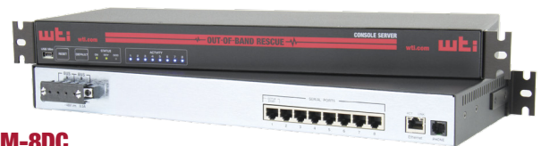
DSM-8DC 8 RJ45 RS232 Ports, -48V DC