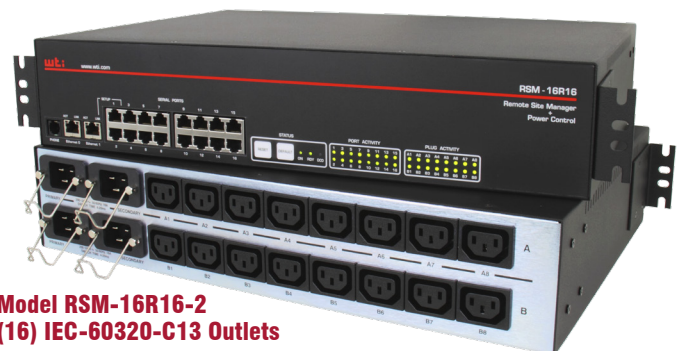
Model RSM-16R16-2 (16) IEC-60320-C13 Outlets