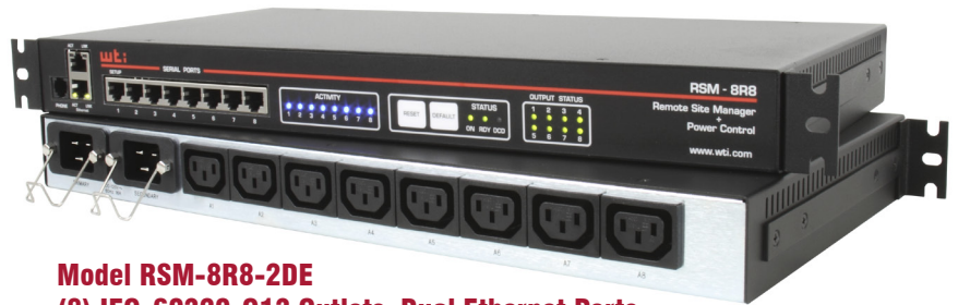
Model RSM-8R8-2DE (8) IEC-60320-C13 Outlets, Dual Ethernet Ports

WTI's RSM Combo series console server/power switches provide system administrators with two vital network management tools in one compact package: secure, remote power control and console port access. This makes the RSM Combo ideal for branch office applications and other installations where rack space is limited. RSM Combos provide a secure, dependable means to control AC power and manage RS232 console ports on rack mount equipment at remote locations. User-friendly alarm functions can monitor network elements for significant status changes and notify network managers via SYSLOG, SNMP Trap or email.