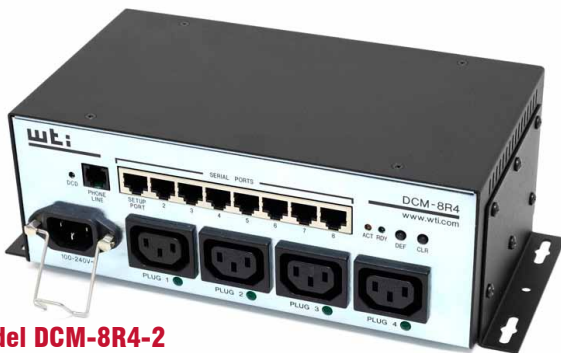
Model DCM-8R4-2 IEC-60320-C13 Outlets

The DCM-8R4's Buffer Mode allows individual ports to capture and store incoming data. This "snapshot" of recently received data is stored in non-volatile memory, and can be viewed, saved or erased by the system administrator at any time. This proves particularly helpful if your application requires sending alarm information or other critical data to a specific port during non-connect periods.