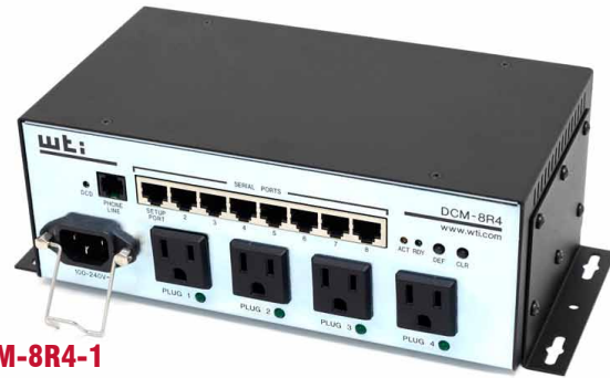
Model DCM-8R4-1 NEMA 5-20R Outlets

WTI's DCM-8R4 series console server/power switches provide system administrators with two vital network management tools in one compact package: secure, remote power control and console port access. This makes the DCM-8R4 ideal for branch office applications and other installations where space is limited.