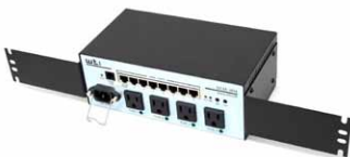
Optional 19" Rack Mount Brackets (DCM-8R4-19R)