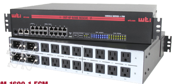
CPM-1600-1-ECM Dual GigE, 16 Port Console Server + 16 Outlet PDU