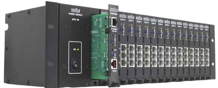
Model AFS-16-1 Shown With 16 Circuit Modules Installed

Have you ever had network gear fail or even your entire LAN/WAN go down at the most inconvenient moment possible? It's easy to keep your network up and running with WTI's AFS-16 RJ45 Fallback Switch. The AFS-16 switches RJ45 data lines between primary and secondary ports to keep data signals pumping throughout your network, and can automatically perform redundancy switching in response to ping command failure or input contact signal changes.