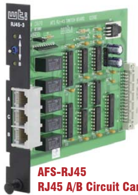
AFS-RJ45 RJ45 A/B Circuit Card