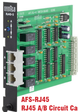
AFS-RJ45 RJ45 A/B Circuit Card