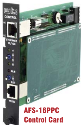
AFS-16PPC Control Card

The AFS-16 unit consists of a Card Rack, one Dual Power Supply Module, one Control Card, and up to 16 Switched Circuit Cards. The modular design allows the AFS to grow as your switching needs grow; by simply adding additional Circuit Cards as your application requires them.